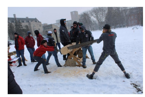
Outdoor Games Competition 2023