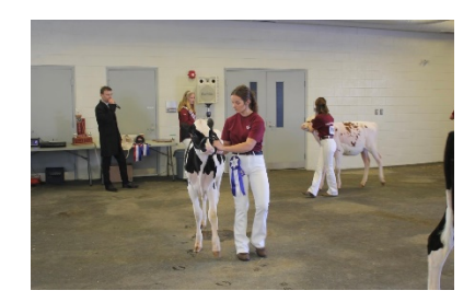
Dairy Show 2023