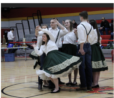
Square Dancing Competition 2023