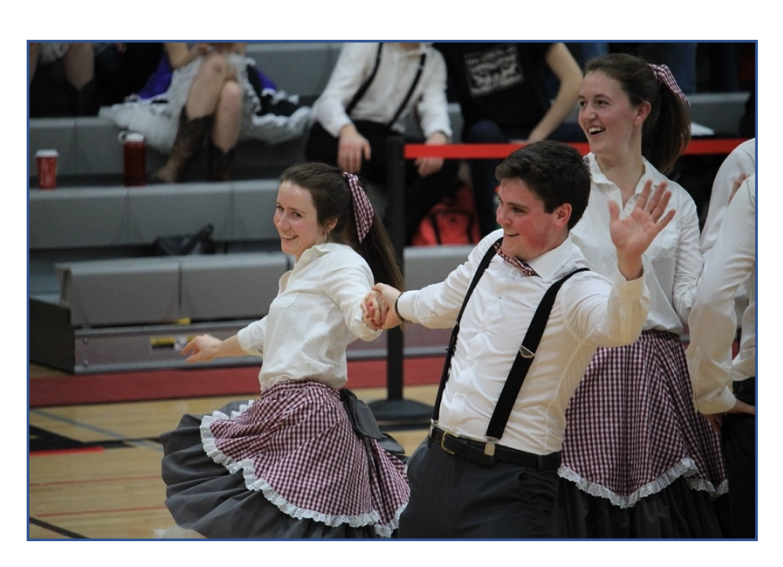
COLLEGE ROYAL SOCIETY