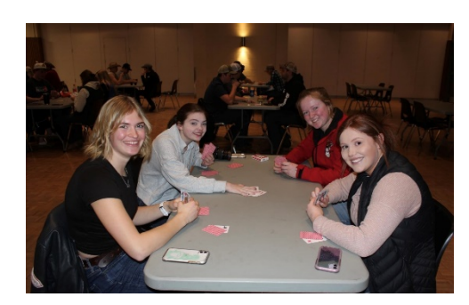
Euchre Tournament 2023